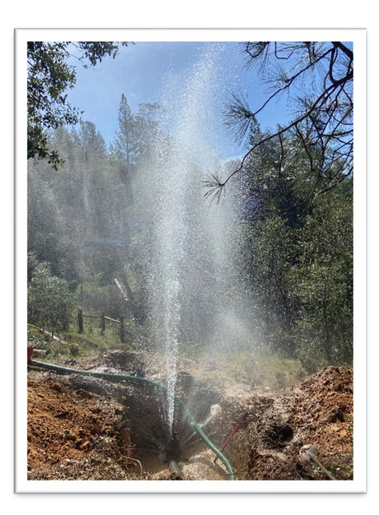
Dewatering the mainline for valve replacement.