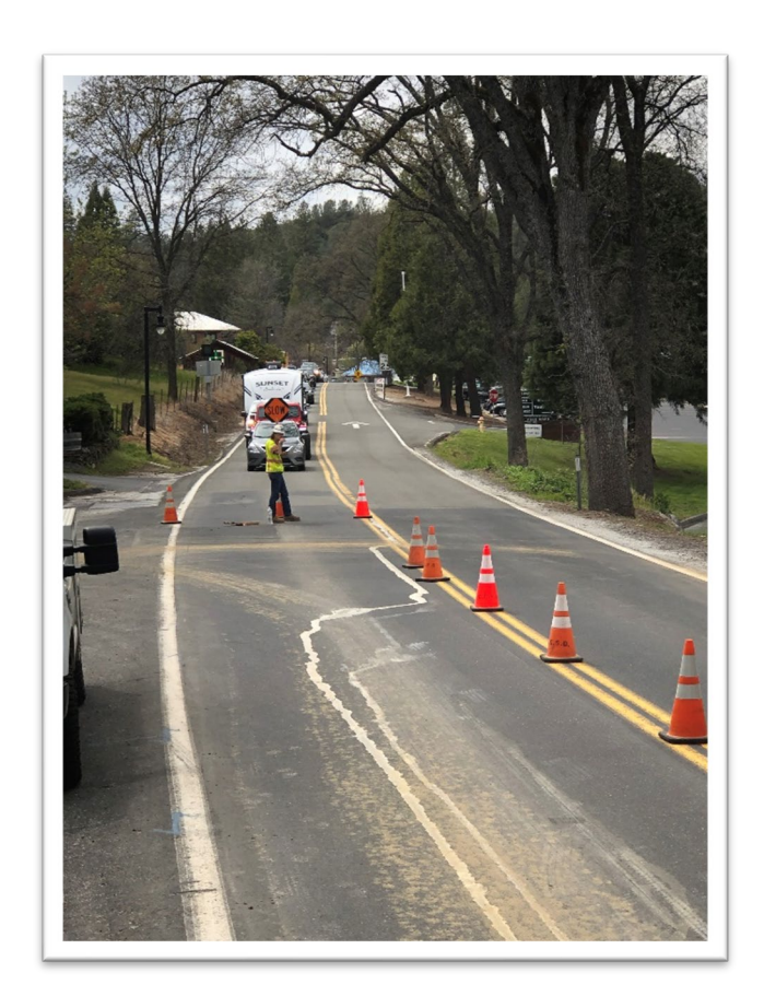
Water Break/Valve Replacement – 19911 Old Hwy 120