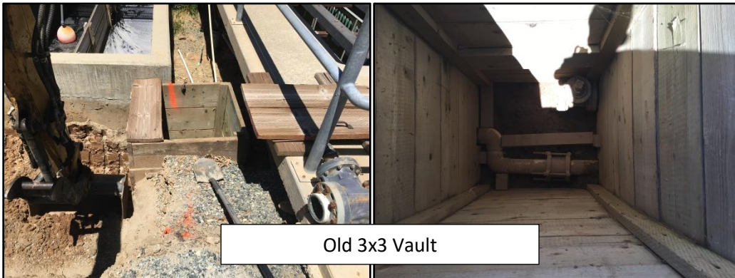
Old 3x3 Vault