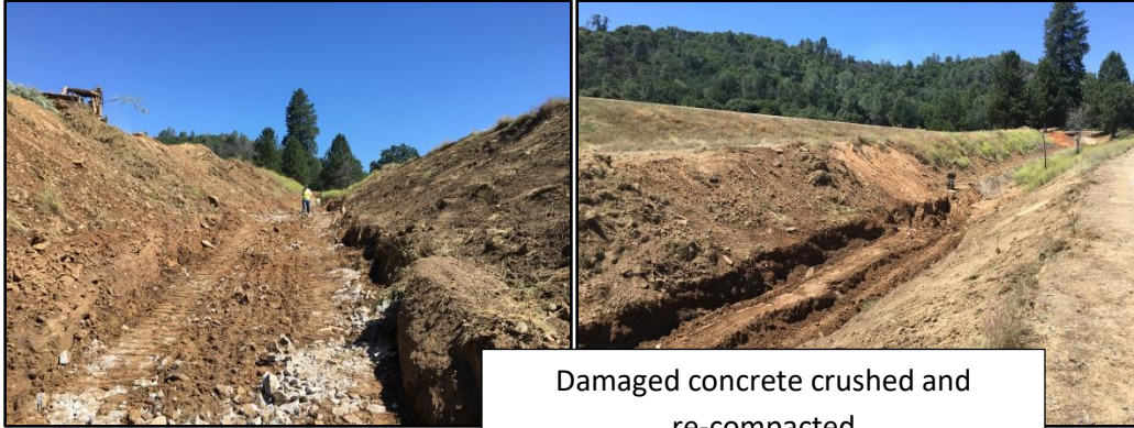
Damaged concrete crushed and re-compacted