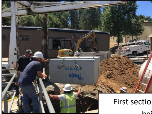
First section of the new vault being placed