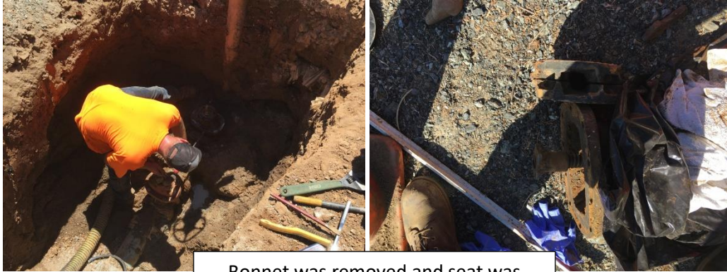
Bonnet was removed and seat was replaced with parts found in Bone yard dated 1979