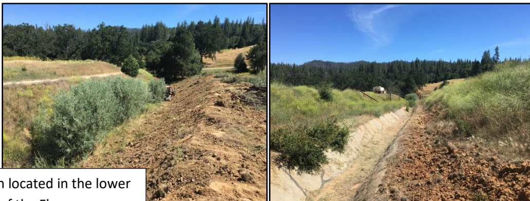
Heavy vegetation located in the lower section of the Flume