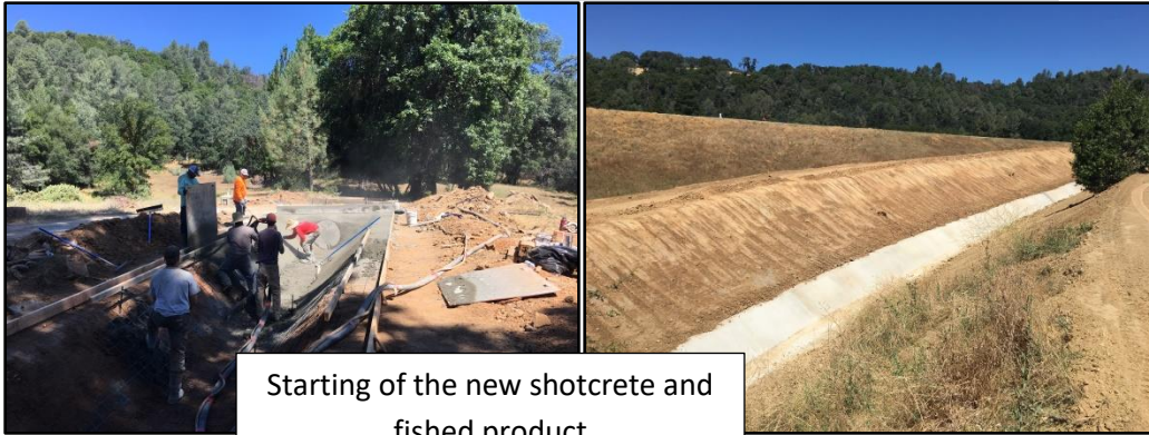
Starting of the new shotcrete and fished product