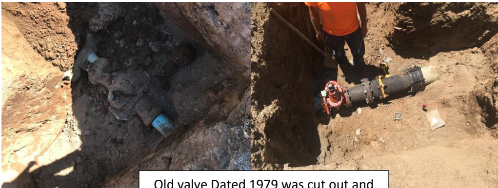
Old valve Dated 1979 was cut out and replaced with new section. Valve was stuck in the open position