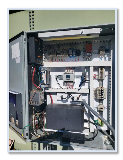
Tank 5 Solar Panel and Power Supply System Installation