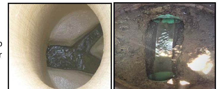
Left: Interior of manhole in proper condition Right: GCS D manhole with corroded concrete and debris

The monthly sewer service charges for all customers