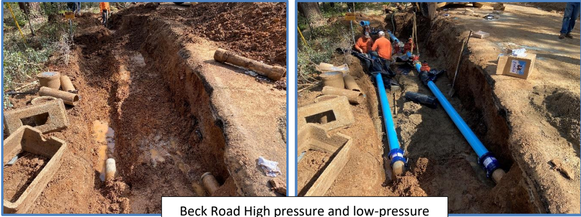
Beck Road High pressure and low-pressure line repair.