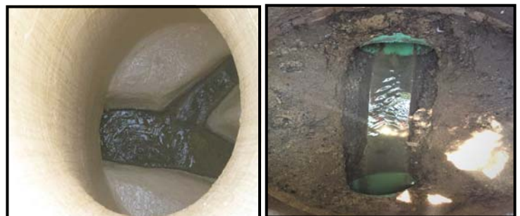
Left: Interior of manhole in proper condition

The monthly sewer service charges for all customers