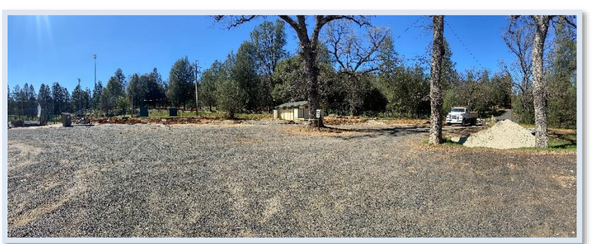
13048 Tip Top Ct Retaining Wall Replacement