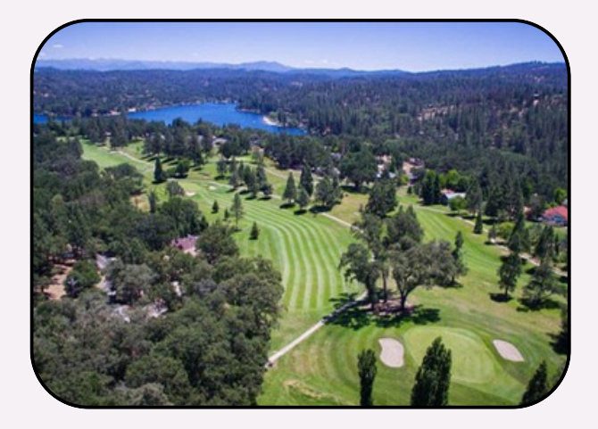
Aerial View of Pine Mountain Lake

In the last five years, GCSD has been awarded over $25,914,000 in State and Federal grants for various projects that improve infrastructure, enhance public services, and ensure the well-being of our community. These projects include hundreds of acres of fuels reduction, sewer collection system upgrades and rehab, water system improvements, replacement of standby emergency generators, and rehab and beautification of our parks.