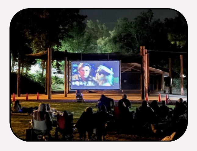
GCSD Movies in the Park