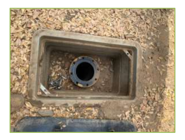
Access point to Lift Station 13 Force Main

Camera crew using push camera with Eldorado Septic keeping up with flow during Force main lock out