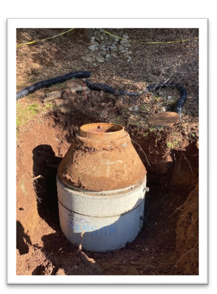
Black Rd – Old style cleanout vs. new mini manhole.