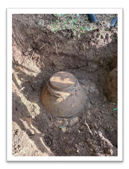
Ferret Ct – Raising a hidden manhole.